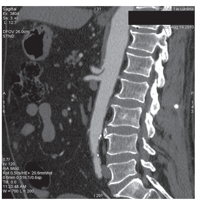
Figure 1 Sagittal, multiplanar reconstructed (MPR) image of the aorta and its two branches shows a narrowing of the proximal part of the celiac trunk.

The procedure was carried out under local anaesthetic in the area of groin. After puncturing the right common femoral artery (Seldinger's method), a 5F pigtail catheter (Balt) was introduced into the descending aorta. Pre-procedural digital subtraction angiography (DSA) confirmed the diagnosis of critical stenosis of the iliac trunk. Before introducing the stent, 5,000U of heparin were administered intravenously. A balloon-inflated stent (Genesis 8 mm × 39 mm by Cordis) was introduced into celiac trunk, with the proximal end of